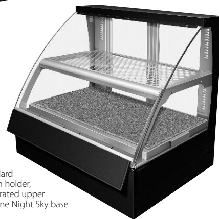
FSCD-2PD in standard Designer Black, sign holder, 3-sided skirt, perforated upper shelf, and Swanstone Night Sky base

Shelf Dimensions – Upper.....31.75"W x 16"D (806 x 406 mm). – Lower .....32.25"W x 19.75"D (819 x 502 mm).