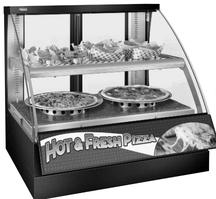
FSCDH-2PD in standard Designer Black, sign holder (sign not included), 3-sided skirt, perforated upper shelf, and Swanstone Night Sky base, with accessory circular perforated riser in stainless steel