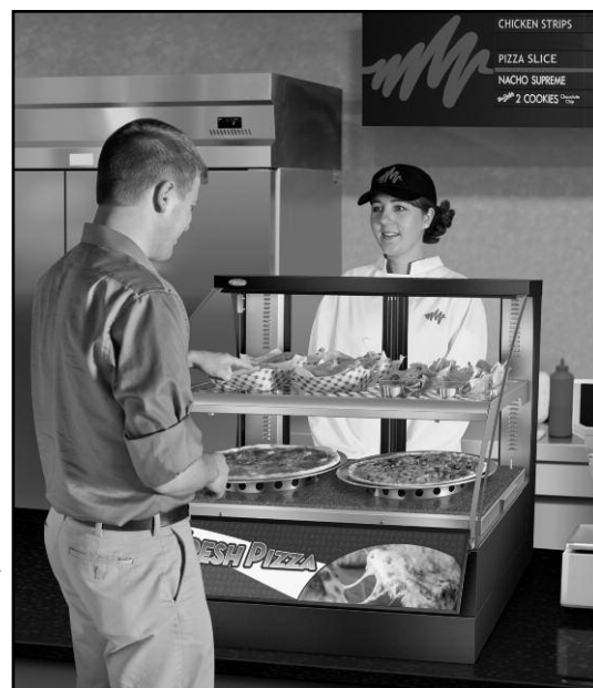
FSCDH-2PD in standard Designer Black, sign holder (sign not included), 3-sided skirt, perforated upper shelf, and Swanstone Night Sky base, with accessory circular perforated riser in stainless steel and food pans

Equipment On Signage Program Hatcographics.com