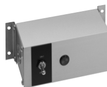
Model RMB-3F with infinite controls

METAL SHEATHED ELEMENTS GUARANTEED AGAINST BURNOUT AND BREAKAGE FOR TWO YEAR.