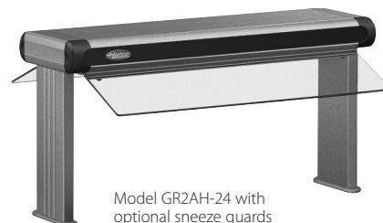
Model GR2AH-24 with optional sneeze guards