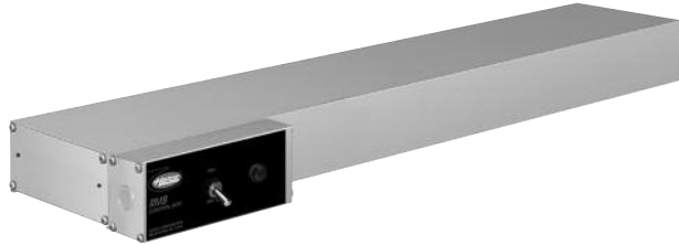
Model GRAM-18 with Control Enclosure with toggle switch and indicator light