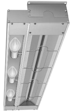
Model GRAML-36 with shatter-resistant incandescent lights, remote control enclosure (not pictured), and standard angle brackets