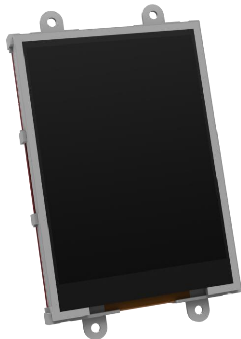
The uLCD-32-PTU Display Module