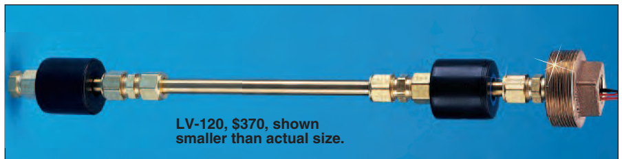
LV-120, $370, shown smaller than actual size.

To determine fluid specific gravity, add 0.1 to float specific gravity in clean liquids and 0.3 to float specific gravity in dirty or viscous liquids.